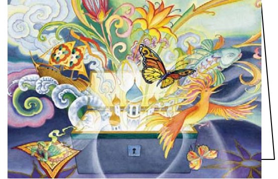
All-Occasion Cards, 1 packet of 10 for $20/pk.

AND WHILE YOU ARE MAKING THIS DONATION, why not purchase some ALL-OCCASION cards to send AT ANY TIME IN THE YEAR? EACH CARD WILL PROVIDE A BOOK TO A CHILD.